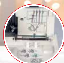
Color-Coded Thread Guides & Easy Threading Lower Looper