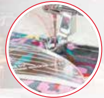
Ruler Quilting Function