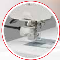
A.S.R.™ (Accurate Stitch Regulator) Compatible (Optional)