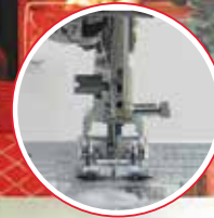
AcuFeed™ Flex Plus Fabric Feeding