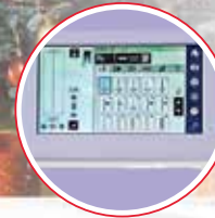
7" Color LCD Touchscreen