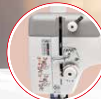
Heavyweight Thread Guide (HWTG)