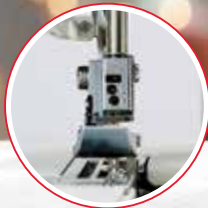
Built-in Needle Threader