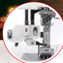
Built-in Needle Threader