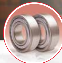
Ball Bearing Main Shaft