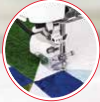
A.S.R.™ (Accurate Stitch Regulator)