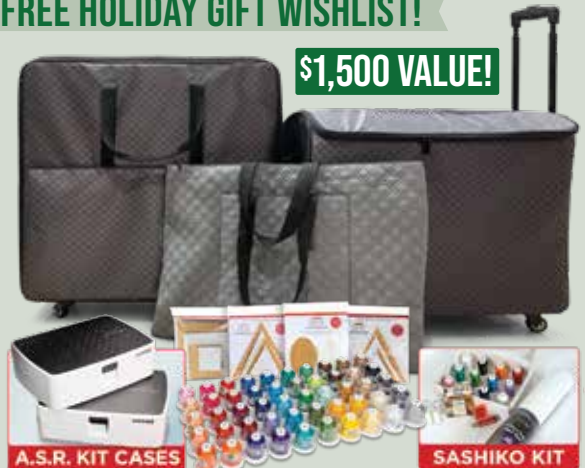
A.S.R. KIT CASES