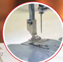
Industrial-type Straight Stitch Only Feeding