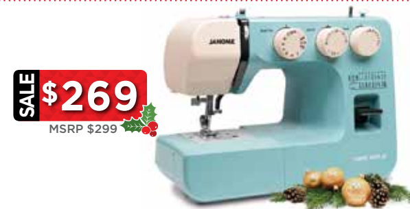
TRAVEL MATE 16

All offers are valid November 1 - December 31, 2024 at participating Janome Authorized Dealers. Offers based on Manufacturer's Suggested Retail Price (MSRP) and may not be combined with any other offer. Pricing is valid with qualifying machine trade in. Void where prohibited.