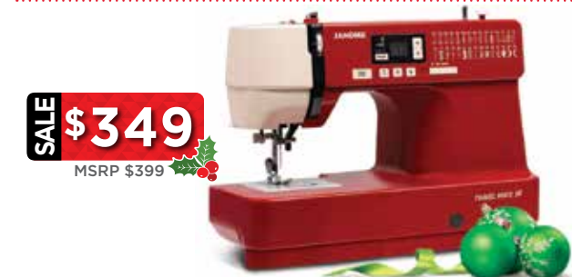
TRAVEL MATE 30