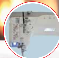
High-Intensity LED Lighting