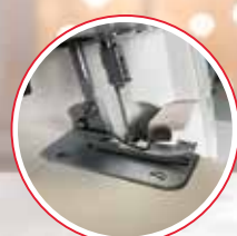
8-Piece Feed Dog for Improved Feeding