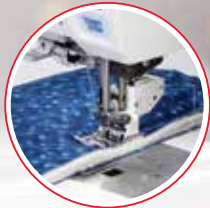
AcuFeed™ Flex Fabric Feeding System