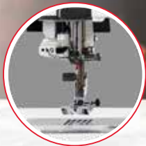
Superior Needle Threader 2