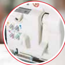
One-Push Blast Air Threading System