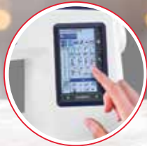
Touch Screen with 13 Languages