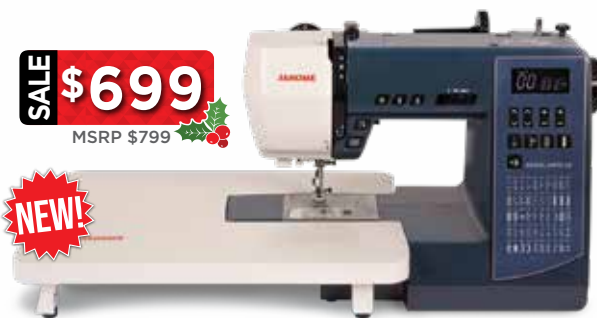
TRAVEL MATE 50