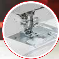
AcuFeed™ Flex Layered Fabric Feeding System