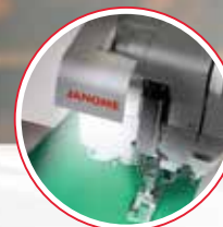
Built-in, Retractable LED Light