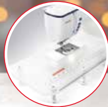
Extra-wide Extension Table Included