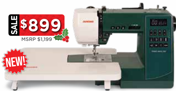
TRAVEL MATE 200

With Janome's stylish Travel Mate Series , now you can take your quilting and sewing passion with you everywhere you go.