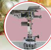
Enhanced Superior Needle Threader 2