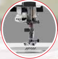
Superior Needle Threader 2