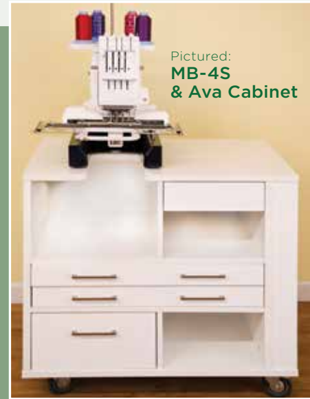
Pictured: MB-4S & Ava Cabinet