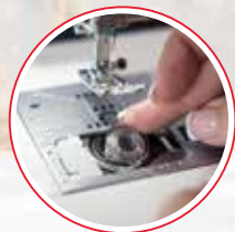
Easy Set Bobbin