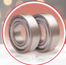
Ball Bearing Main Shaft