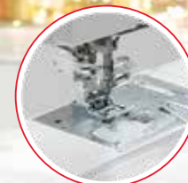
AcuFeed™ Flex Layered Fabric Feeding System