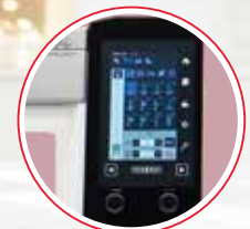
Hi-Definition 5" LCD Color Touchscreen