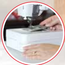
One-Step Needle Plate Conversion