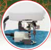
A.S.R.™ (Accurate Stitch Regulator)